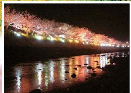
2. 河津櫻夜間燈光景觀 (賞櫻會期間，每晚18點至21點開放)